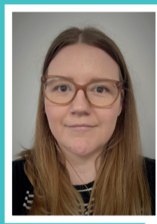
JADE CARE 01604 734046