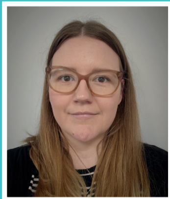
JADE CARE 01604 734046