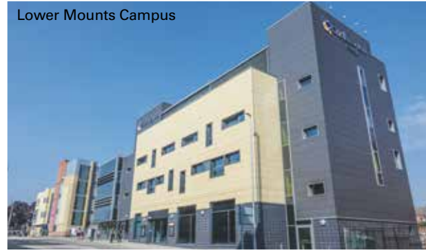
Lower Mounts Campus

Our Skills Centre is also based at Lower Mounts. We run part-time courses for anyone looking to improve their job prospects or get back in to education.