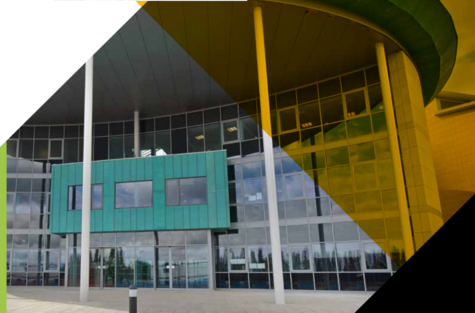
Booth Lane Campus